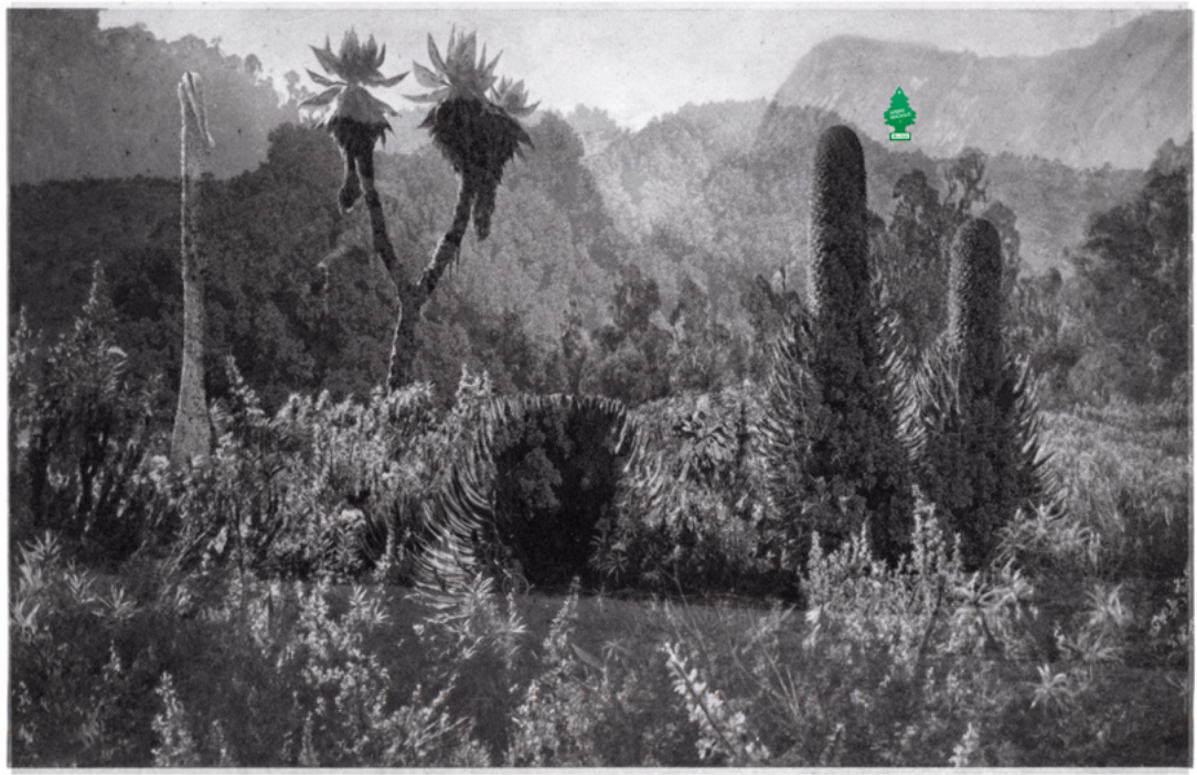
Images (top left) Aldo Rossi, Teatrino Scientifico , 1978. Courtesy of the Fondazione Rossi; (top right) Aldo Rossi, Teatrino Scientifico , Scena con cabine , 1978; (bottom) Batia Suter, Sketch , 2017. Courtesy of the artist.