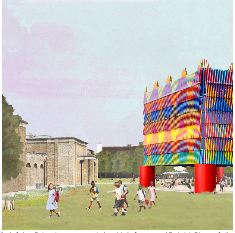
Pricegore and Yinko Ilori, Colour Palace in context, rendering, 2018. From the 2018 Graham Foundation Organizational Grant to Dulwich Picture Gallery for the exhibition Colour Palace, Dulwich Pavilion 2019