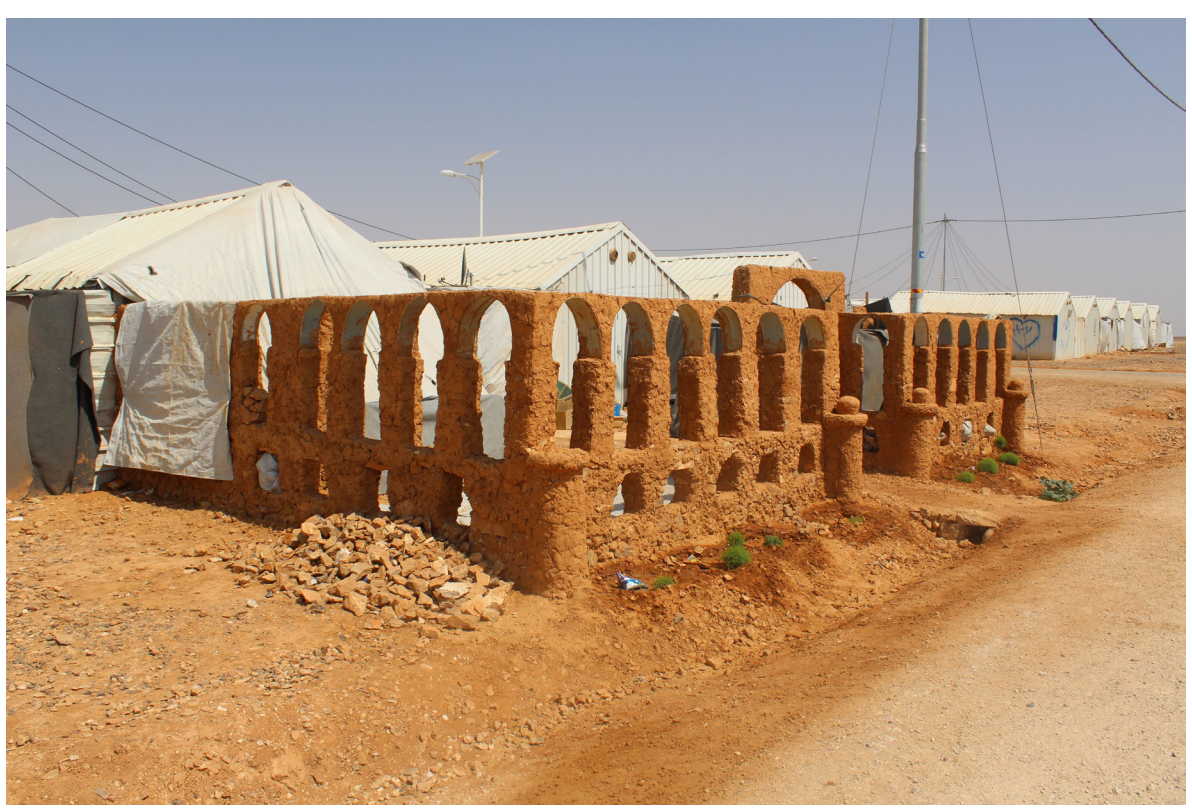
Future Heritage Lab, A cultural shelter/adobe interpretation of the Palmyra Arch of Triumph at the Al Azraq Refugee Camp, Jordan, 2017. From the 2018 Graham Foundation Organizational Grant to Massachusetts Institute of Technology—Future Heritage Lab for the publication 1002 Inventions: Art and Design in Al Azraq Refugee Camp