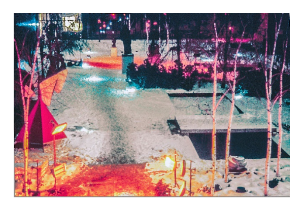
Pulsa, Sculpture Garden installation for Spaces , 1970, The Museum of Modern Art, New York. From the 2019 individual grant to Larry D. Busbea for The Responsive Environment: Design, Aesthetics, and the Human in the 1970s