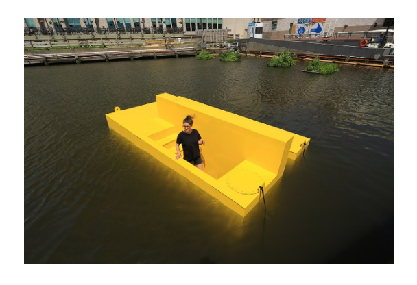
Floating classroom prototype. From the 2019 individual grant to Eric Höweler and Meejin Yoon for Signal to Noise