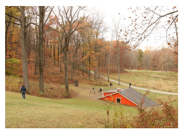
Heather Hart, The Oracle of Lacuna (participation detail, exterior fall), 2017. Wood, tar shingles, paint, steel, iPad, speakers, 12 x 67 x 20 ft. Storm King Art Center, New Windsor, NY. From the 2019 individual grant to Heather Hart for Afrotecture (Re)Collection