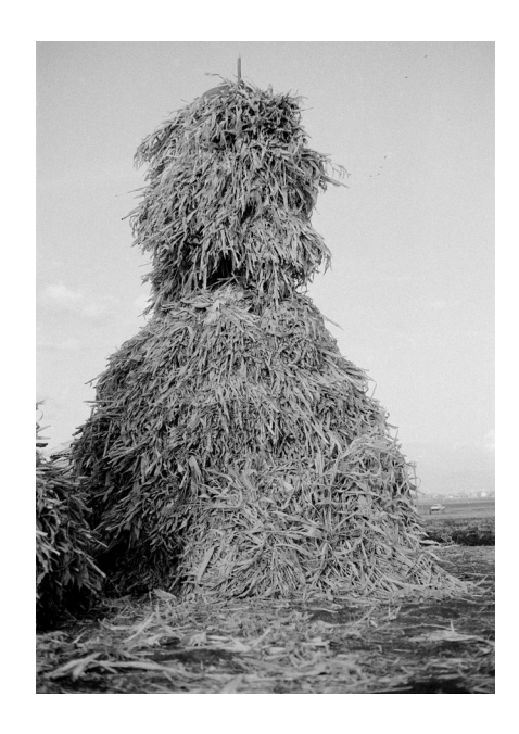
Lala Meredith-Vula, Haystacks 1989—ongoing: Llazareve, Kosova, 9 November 1989 No. 1, photograph from 35mm negative. From the 2019 individual grant to Lala Meredith-Vula for Haystacks 1989—ongoing