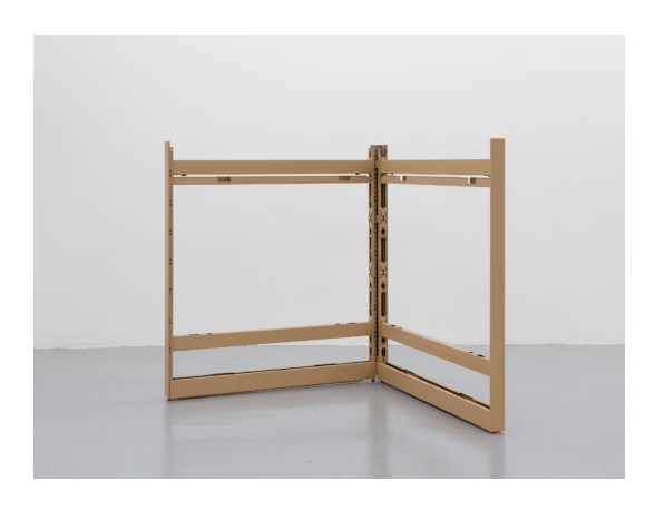
Jessica Vaughn, Depreciating Assets: Variable Dimensions (detail), 2018. Metal, lacquer paint, and hardware, dimensions variable. Exhibition view of the artist's solo exhibition, Exit Strategy at Emalin Gallery, London. From the 2019 individual grant to Jessica Vaughn for Office Architecture and Invisible Bodies