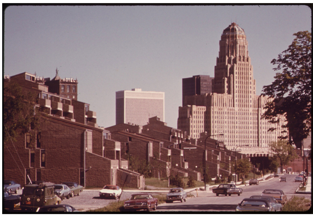
Shoreline Apartments, view towards Buffalo City Hall, ca. 1970s. From the 2019 Graham Foundation Organizational Grant to El Museo Francisco Oller y Diego Rivera for the exhibition Paul Rudolph's Shoreline Apartments