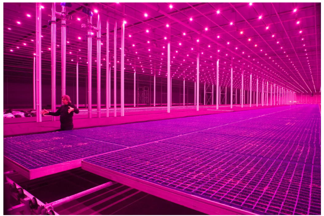
Countryside, The Future, a collaboration between the Guggenheim and AMO / Rem Koolhaas, examines radical changes transforming the nonurban landscape and culminates in an exhibition at the Solomon R. Guggenheim Museum, New York, opening February 20, 2020. Photo: Pieternel van Velden (Koppert Cress, The Netherlands 2011). From the 2019 Graham Foundation Organizational Grant to Solomon R. Guggenheim Museum for the publication Countryside, The Future