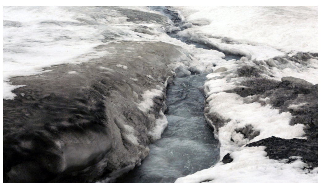
Susan Schuppli, Learning from Ice , production still from the Athabasca Glacier, Columbia Icefield, Canada, 2019. From the 2019 Graham Foundation Organizational Grant to Toronto Biennial of Art for the exhibition Learning from Ice