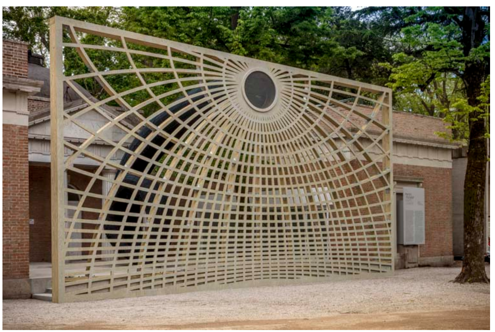
Martin Puryear, Swallowed Sun (Monstrance and Volute), 2019. Southern yellow pine, steel, polyester, canvas, rope, overall 22 ft. 8 in. × 44 ft. × 24 ft. 3 in. Installed in Martin Puryear: Liberty/Libertà, May 11-November 19, 2019, La Biennale di Venezia, US Pavilion, Venice, Italy. Collection of the artist. Courtesy Matthew Marks Gallery and Madison Square Park Conservancy. From the 2019 Graham Foundation Organizational Grant to Madison Square Park Conservancy for the exhibition Martin Puryear: Liberty/Libertà: US Pavilion, 58th International Art Exhibition