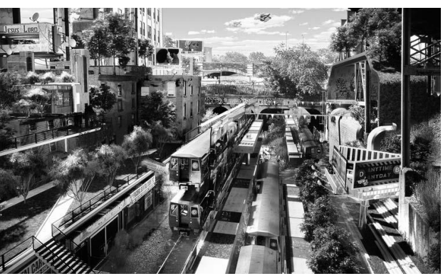
Olalekan Jeyifous, ... other seasonal occupancy neighborhoods, 2020. The Museum of Modern Art, New York. From the 2020 organizational grant to The Museum of Modern Art for the exhibition Reconstructions: Architecture and Blackness in America