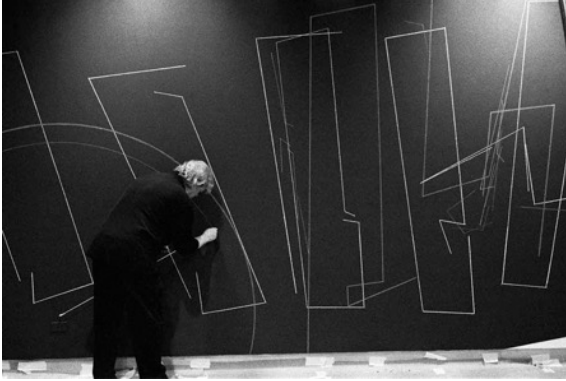
Lebbeus Woods, view of The Storm , installation, Arthur A. Houghton Jr. Gallery, The Cooper Union, New York, 2001–02. Black and white photograph. From the 2025 grant to A83 for the exhibition series A83 Exhibition Program, 2025–26