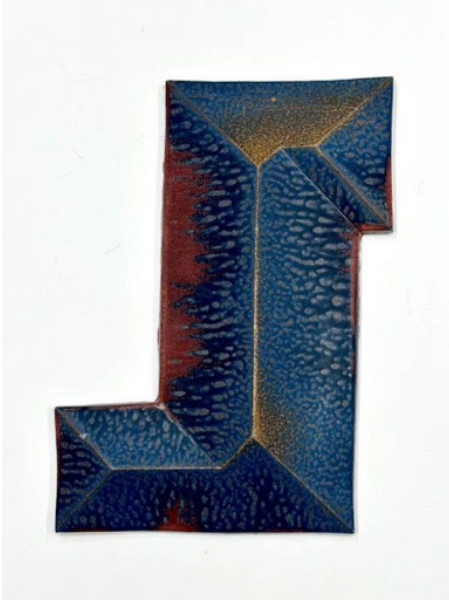
Alison Ruttan, 'Paradox in Inaction,' Series No. 1. 5547, (deep blue, red gold), 2024–25. Cast glazed ceramics, approx. 18 x 12 x 3 in. Courtesy the artist. From the 2025 grant to Hyde Park Art Museum for the exhibition Alison Ruttan: The Paradox of Inaction