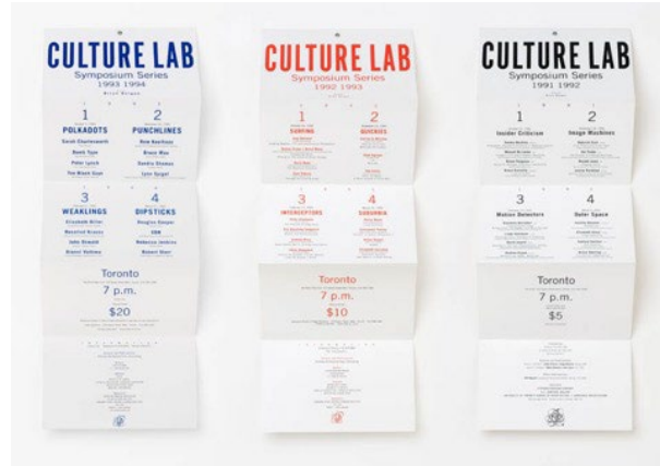
Brian Boigon, Culture Lab symposium series posters , 1991–94. Ink on paper, 27 1/2 x 9 1/4 in. Courtesy Brian Boigon fonds Collection, Canadian Centre for Architecture, gift of Brian Boigon. From the 2025 grant to Canadian Centre for Architecture for the exhibition Culture Lab