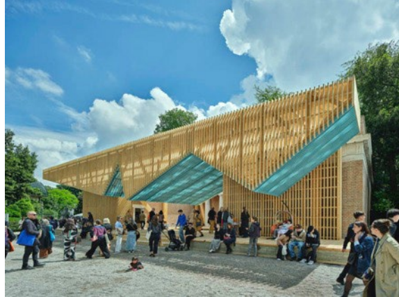
Exterior Front Façade, PORCH: An Architecture of Generosity, US Pavilion, 19th International Architecture Exhibition—La Biennale di Venezia, Venice, 2025. Digital photograph. From the 2025 grant to University of Arkansas—Fay Jones School of Architecture for the exhibition PORCH: An Architecture of Generosity: US Pavilion, 19th International Architecture Exhibition