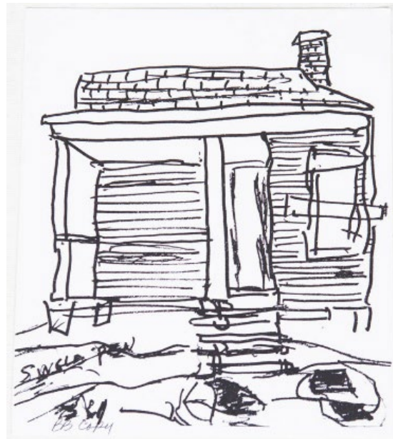
Beverly Buchanan, Untitled , n.d. Toner on cardstock, 4 x 4 in. Courtesy private collection. Photo: Mo Costello and Katz Tepper. From the 2025 grant to Institute 193 for the publication Beverly's Athens