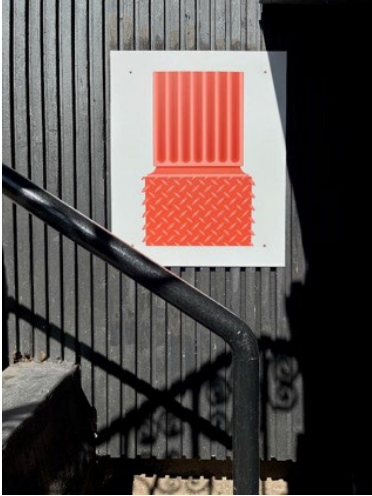
Installation view, Citygroup Bulletin , 2022. Digital photograph. From the 2025 grant to Citygroup for the exhibition series Citygroup Exhibition and Debate Program , 2026