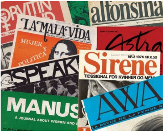
Feminist Periodicals , 2024. Digital collage. From the 2025 grant to Bikin Books for the publication Fem Pub 1960–1990: A Visual Compendium of Feminist Periodicals