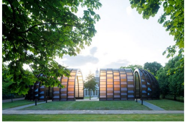
Marina Tabassum, Marina Tabassum Architects, A Capsule in Time , Serpentine Pavilion, London, 2025. Digital photograph. Copyright Marina Tabassum Architects (MTA). Courtesy Serpentine. Photo: Iwan Baan. From the 2025 grant to Serpentine Galleries for the exhibition A Capsule in Time, Serpentine Pavilion 2025 by Marina Tabassum